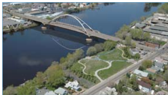
Artist rendering of the Lowry Avenue Bridge

This exciting project involves the construction of a new cable-stayed, tied-arch bridge over the Mississippi River and the Canadian Pacific Railroad.