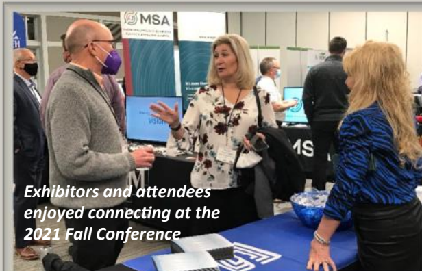
Exhibitors and attendees enjoyed connecting at the 2021 Fall Conference