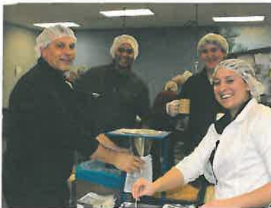
Members volunteering at Feed My Starving Children

The Chapter Membership committee continues to host a variety of both technical and social events throughout the year for our members. Past tours have included visits to the Lowry Bridge project, the Hiawatha Maintenance Facility, a Saint Paul Saints baseball game, and a visit to the 35W Bridge Construction Project.