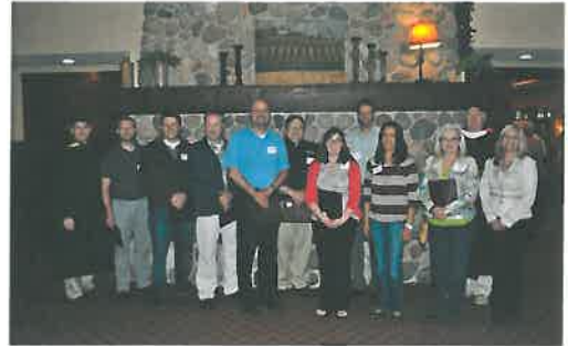
2013 Leadership Academy Graduates