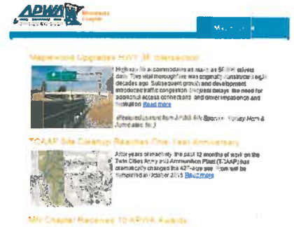
Latest News Email Blast