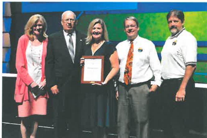
Minnesota Chapter, PACE Award Recipient

Also recognized at the award ceremony are scholarship recipients and graduates of our North Hennepin Community College Certificate program, many of whom are not yet members of APWA. The