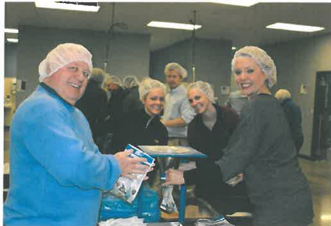
Chapter Members Volunteering at Feed My Starving Children

members assembled over 16,000 meal packages to poverty stricken children in third world countries located in the Caribbean and Africa.