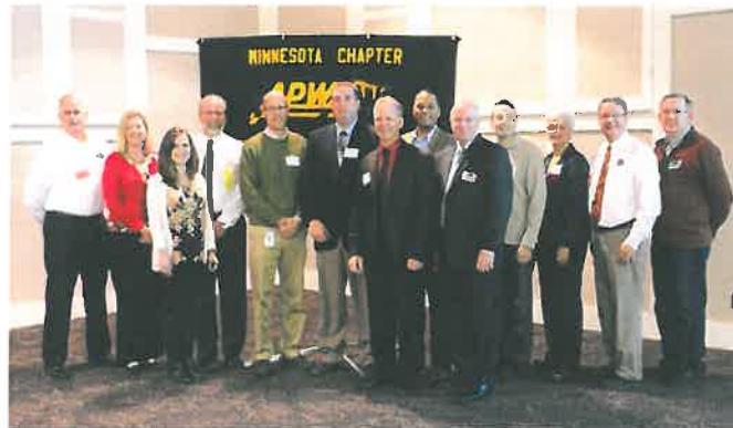
2013 Executive Committee Members