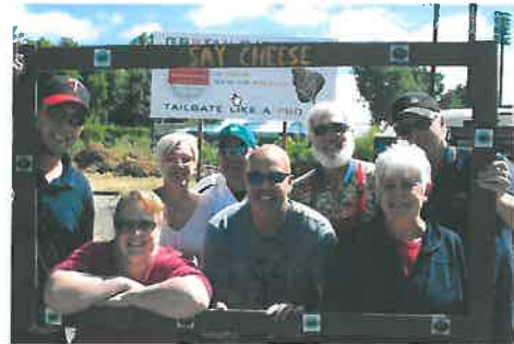
Chapter Members enjoying a Saint Paul Saints baseball game

The Minnesota Chapter of APWA has incorporated both a community outreach and an environmental service event into our membership recruitment efforts. Chapter members once again joined together in March to volunteer with Feed My Starving Children, assembling meals to be sent to poverty stricken children in third world countries of the Caribbean and Africa. This event was held at three different locations to meet member interest.