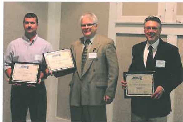
2013 Project of the Year Award Recipients – Cascade Avenue Reconstruction Project

The second award recipient was the City of River Falls, Wisconsin for the Cascade Avenue Reconstruction Project. Included on the team were SEH, Inc. and Haas Sons, Inc. On much different scales, both projects demonstrated effective teamwork and innovative solutions.