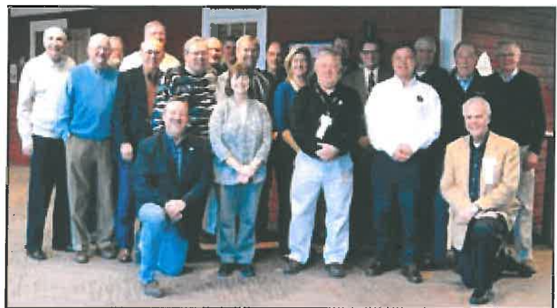
Minnesota Chapter Past Presidents Breakfast