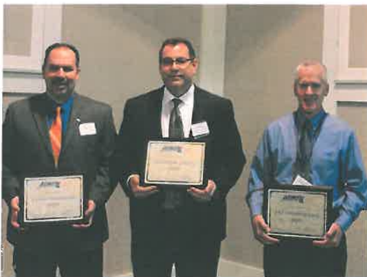
2013 Project of the Year Award Recipients – Lowry Bridge Reconstruction Project

The Chapter was pleased to award two Project of the Year awards in 2013. Recipients included the Lowry Bridge Construction Project led by Hennepin County with a team consisting of SRF Consulting Group, Inc. and Lunda Construction.